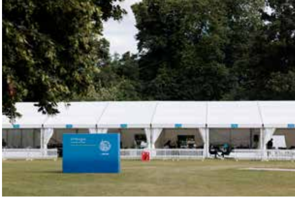
Disclaimer. The imagery used is an illustration of the Evolution hospitality Units on offer and not a replica.

Access to outdoor hospitality spaces will be managed by Team Captains. Wristbands will not be required for outdoor hospitality in 2025.